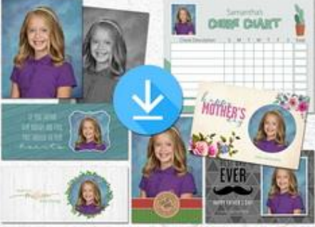
Image Pack Deluxe Digital Download (includes templates, all backgrounds and unlimited copyright release)