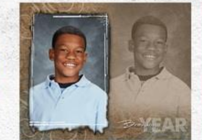
Wallet Fobs Magnets