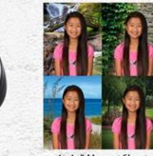
4 - 4x5 Magnet Sheet (w/outdoor backgrounds shown)